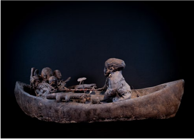
Pirogue with a chained woman