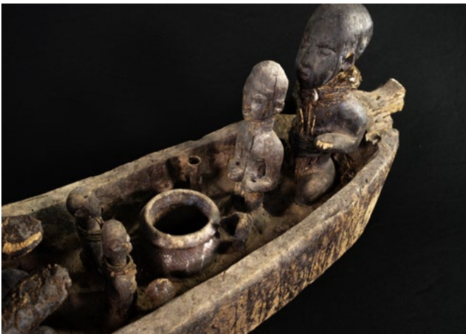
Twin Pirogue (detail)